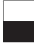
1/2 Pg. Horz.