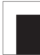
1/2 Pg. Island