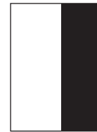
1/2 Pg. Vertical