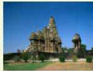
Khajuraho, the temple famous for its exquisitely carved temples in stone