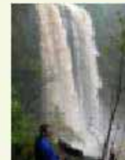
Pachmarhi, the walker's paradise