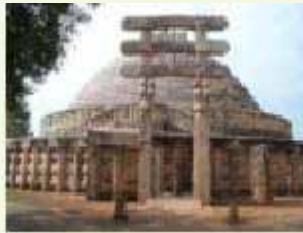
Sanchi Stupa, synonymous to the masterpieces of Buddhist art